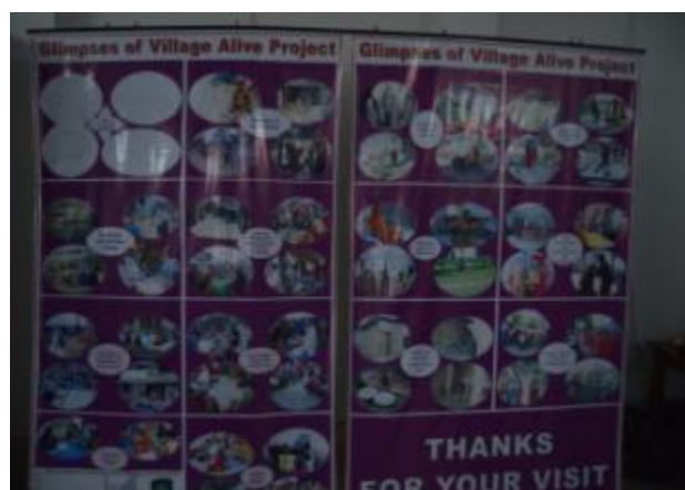
Flex displayed about the Village Alive Project