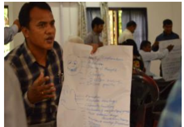
One group representative explaining their ideas to other group members.