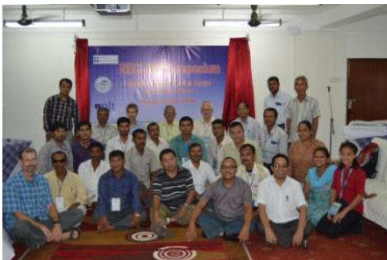
Organizers Group Photo